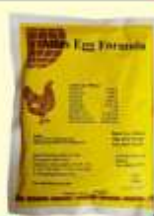
ATLAS EGG FORMULA