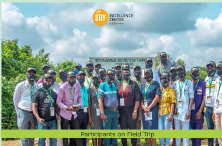
Participants on Field Trip

The Nigerian Soy Excellence Center (SEC Nigeria) was established with a vision to support agriculture as a foundation for a healthy and growing Nigeria with soya as a solution for Nigeria's protein needs. The concept is to help growing markets like Nigeria address protein challenges and create a "cascade of demand" for soy and soy-related products. The goal is to provide agricultural expertise and facilitate connections that drive market possibilities across the agri-food value chain.